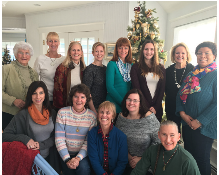
Lots of smiles!