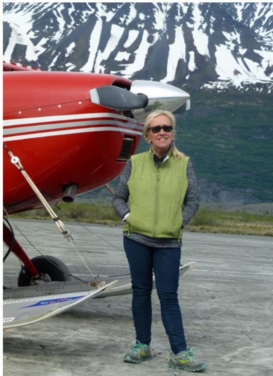
Knik Glacier in Alaska, during a training flight

I am an automotive journalist and author. I travel the globe test driving cars and trucks, working for magazines, newspapers, television, radio and the Internet to provide vehicle reviews, as well as adventure stories about racing and automotive expeditions throughout the world.