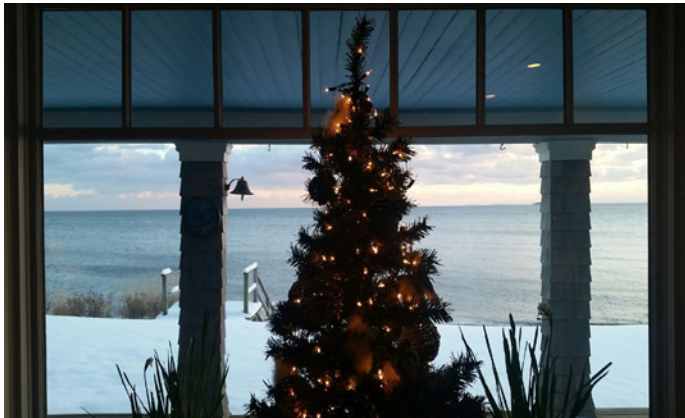
The view from Nancy's window